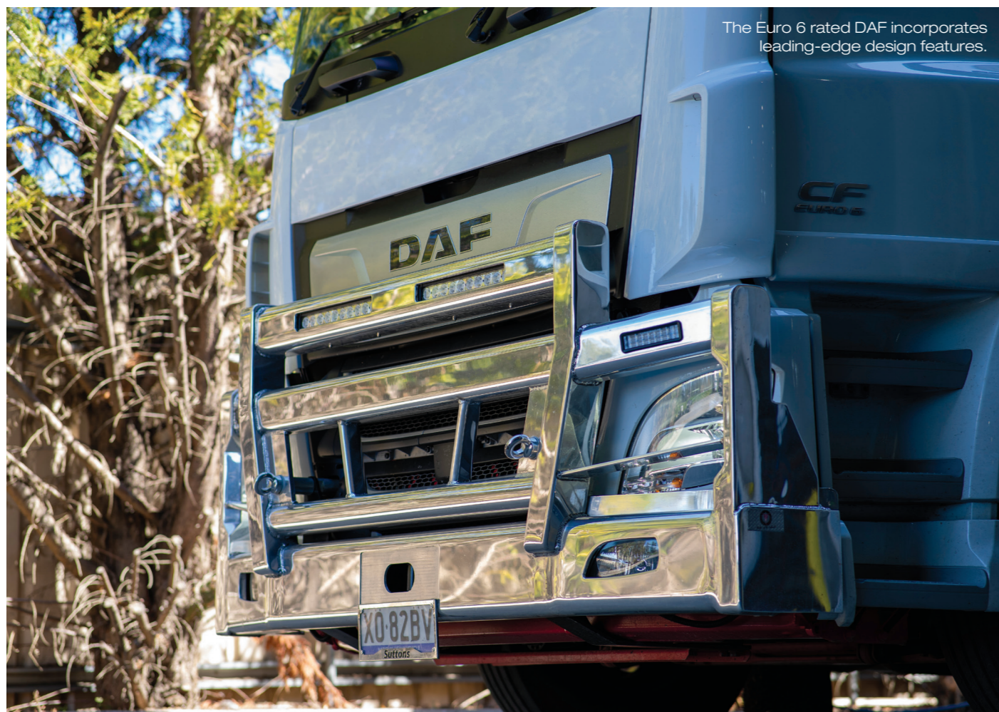
The Euro 6 rated DAF incorporates leading-edge design features.