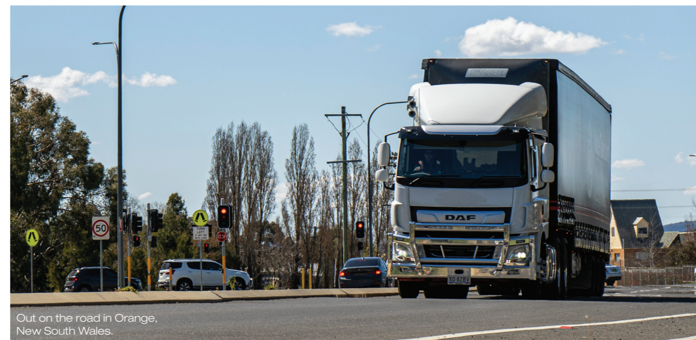
Out on the road in Orange, New South Wales.