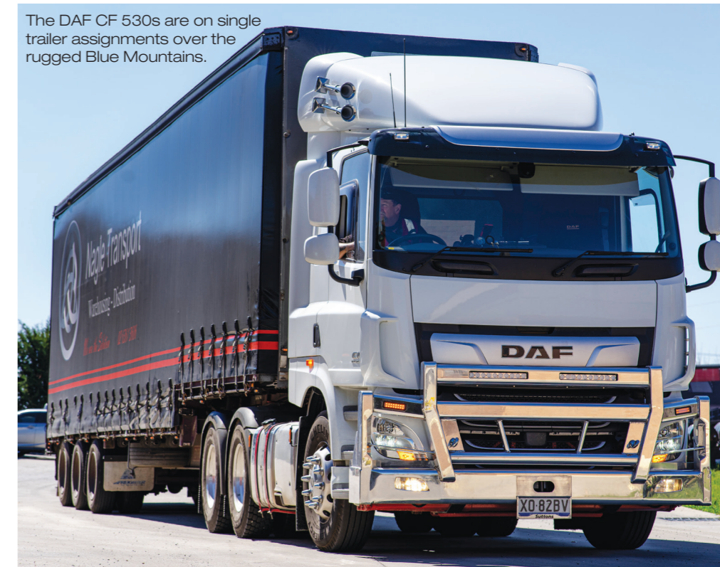
The DAF CF 530s are on single trailer assignments over the rugged Blue Mountains.