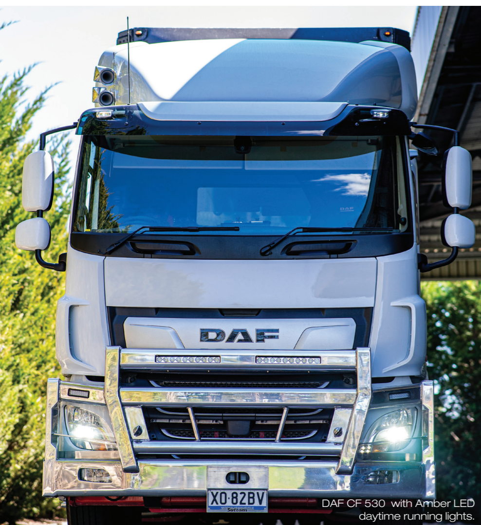
DAF CF 530 with Amber LED daytime running lights.

Nagle Transport, a well-established independent carrier in New South Wales, has introduced into its regional fleet the first of two DAF CF 530s from long-time ally Suttons Arncliffe.