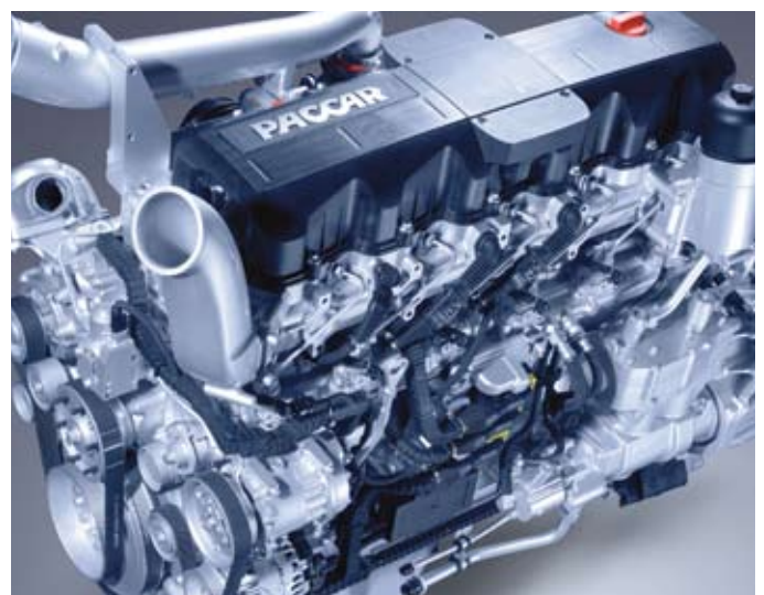
PACCAR MX Engine

With powerful partnerships such as these, the new DAF is a winner in every respect.